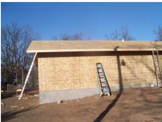
The addition is enclosed

Some things might seem so far away when we are stuck inside during the winter, but I have great news for you: Camp isn't very far away! In fact it is coming and it is going to be great! This year we have a great line up of deans, which means camp is going to be something special that you won't want to miss. So, take this newsletter and get out your new 2012 calendar and reserve the dates for your camp next year. Look carefully as some of the dates and grade combinations might be different from this past year. See you soon!