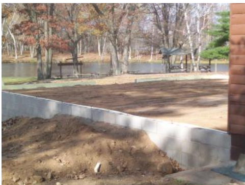
Frost Wall Poured