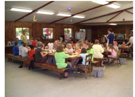
Inside Dining Hall