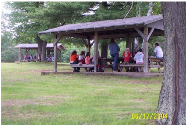
Shelters for classes or fellowship