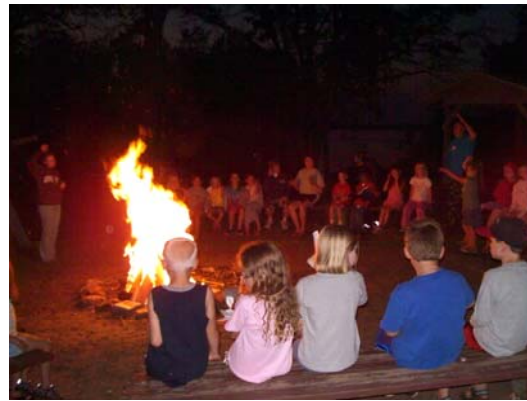
A favorite of all—camp fire