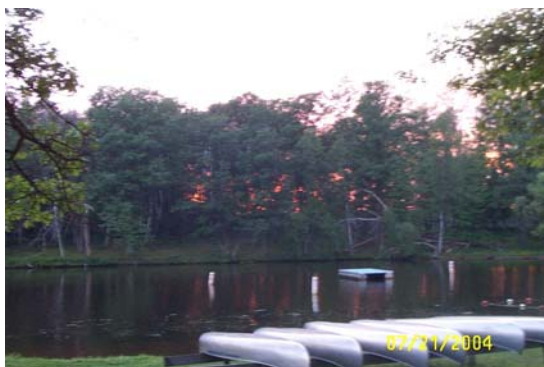
Sand beach area for swimming And canoeing