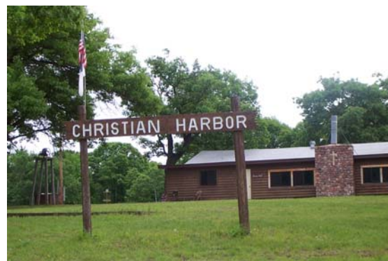
Main lodge and dining hall