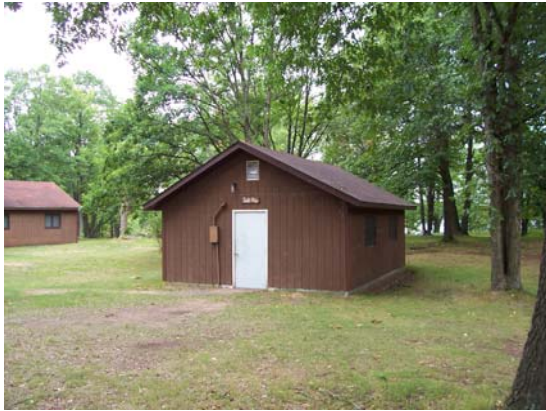
8 Cabins will sleep about 100