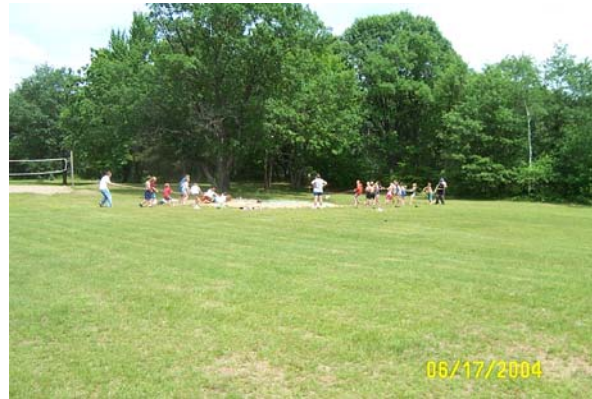
Softball, volleyball, tether ball And other activities